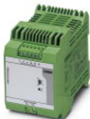
Primary-switched MINI POWER power supply for DIN rail mounting, input: 1-phase, output: 10 V DC ... 15 V DC/8 A

Please be informed that the data shown in this PDF Document is generated from our Online Catalog. Please find the complete data in the user's documentation. Our General Terms of Use for Downloads are valid ( http://phoenixcontact.com/download )