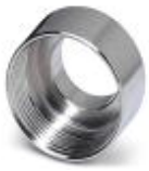
Step-up adapter, M20 to M25, including O-ring

Extension adapter - ENLAR-M-KV-M20/M25 - 1647666