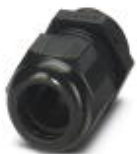
Cable gland, Cable gland material: Polyamide 6, External cable diameter 6 mm ... 12 mm, Shielding: No, Connecting thread: M20, Color: jet black RAL 9005

Cable gland - G-INS-M20-S68N-PNES-BK - 1411133