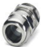
Cable gland, Cable gland material: Brass, nickel-plated, External cable diameter 6 mm ... 12 mm, Shielding: No, Connecting thread: M20, Color: silver

Cable gland - G-INS-M20-S68N-NNES-S - 1411163