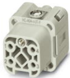
HEAVYCON female insert, A4 series, 4-pos., screw connection without wire protection, with IP65 sealing screw

Please be informed that the data shown in this PDF Document is generated from our Online Catalog. Please find the complete data in the user's documentation. Our General Terms of Use for Downloads are valid ( http://phoenixcontact.com/download )